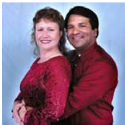
Figure Clinic Instructors